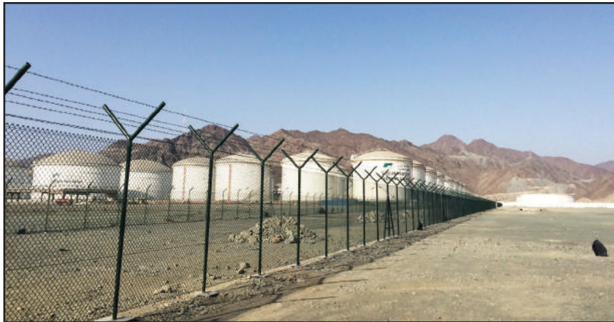
Client: M/s PETRIXO Oil & Gas, Project: 2500 mtr Chain Link Fence @ Petrixo Bio Fuel Refinery, Consultant: MUC Engineering