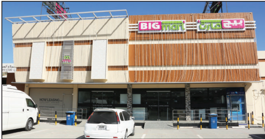
Client: Big Mart, Project: Construction of Mezanine Floor and Modification Works, Consultant: Alfath Engineering Consultancy, Location: Al Hayle Village