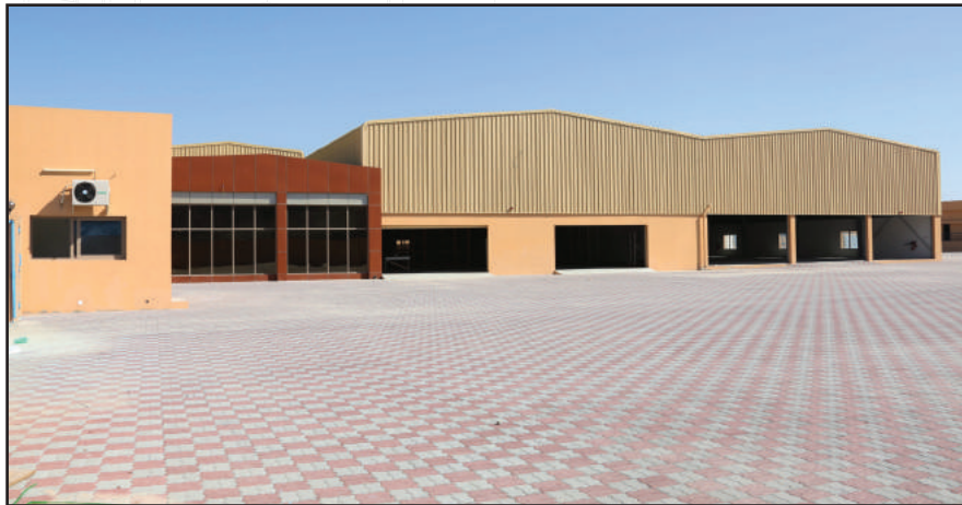
Client: M/s BOSCO Aluminium & Glass Co LLC, Project: Aluminium Work Shop - G+M +Staff Accommodation + Service Block + Watchman Room +CW, Consultant: Mozoon Engineering Consultancy, Location: Al Hayle Village