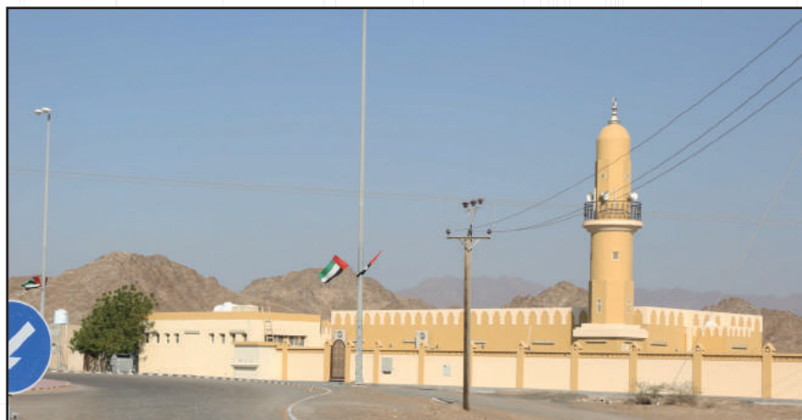
Client: Siji Masjid, Project: Renovation, Consultant: Ministry of Public Works, Location: Siji