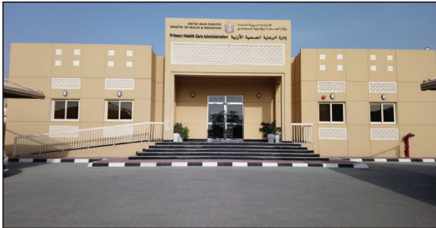
Client: Merashid Health Centre, Project: Construction of Admin Building, Consultant: Ministry of Public Works, Location: Merashid