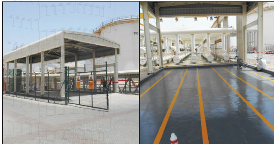
Client: Vopak Horizon Fujairah Ltd, Project: Chemical Injection Facility for whiteoil lines in manifold 1 & 2.