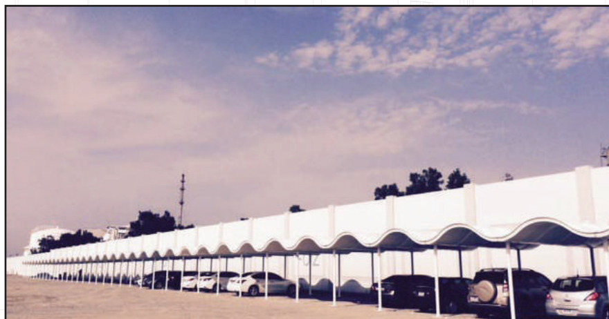
Client: M/s VTTI Fujairah Terminals Ltd (VTTI FTL) Fzc, Project: Supply & Fixing of GRP Wave model Car Park -40 nos.