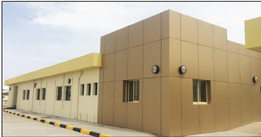
Client: Siji Hospital, Project: Renovation, Consultant: Ministry of Public Works, Location: Siji